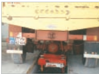
P300 hand pump and 10 ton cylinders used for a vehicle lift.